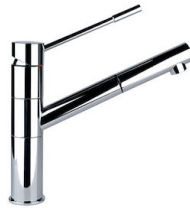
Mixer Tap Lorenzo 8466 000