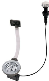
Automatic waste fitting 8407 000