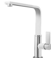
Mixer Tap NYC 8486 000