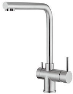
Mixer Tap Gamma 3 vie - satin 8496 100