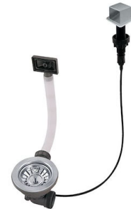
LIRA automatic waste fitting 8407 103