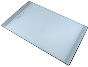
Glass chopping board 8631 300